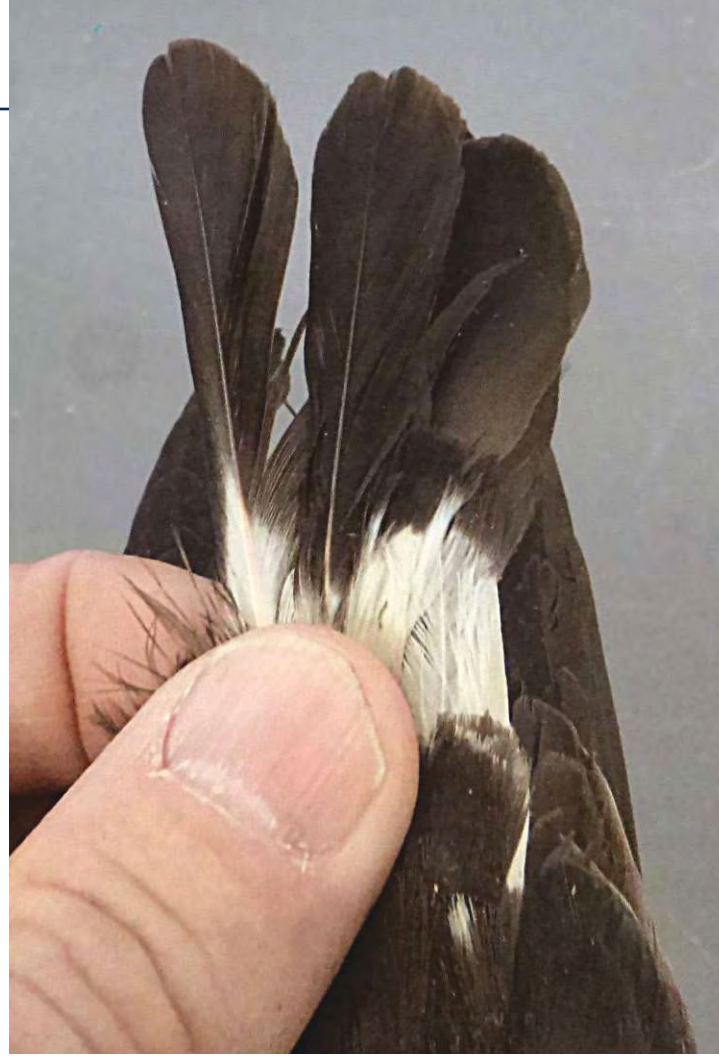
Fig. D2.

FIGS. E These specimens of Band-rumped Storm-Petrels and Leach's Storm-Petrels at BPBM (Fig. E1, left to right: 185162, 184416, and 156975 of Band-rumped and 184055, 184591, and 7559 of Leach's) and CAS (Fig. E2, left to right: