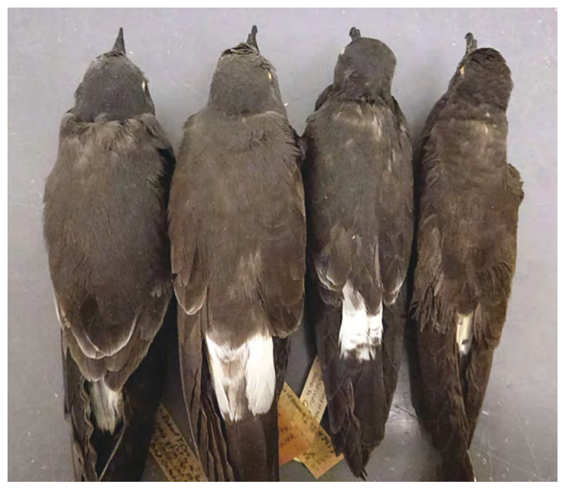
Fig. E1 (below): Specimens collected in or near the Hawaiian Islands. Left to right October 4, 1906; September 3, 2001; July 12, 1893; December 29, 1997; December 24, 2003; and March 10, 1892. Fig. E2 (above): Specimens collected, left to right, off California, October 4, 1950; off Alaska, June 17, 1896; in the Galápagos Islands, August 13, 1906; and near the Galápagos Islands, May 8, 1906.

of Band-rumped) show the affects of age and wear on plumage tone. Direct comparison of specimens indicates that fresh juveniles of both species (BPBM 185162 and 184055 and CAS 61107 and 514) are the same shade of sooty gray, fresh adults of both species (BPBM 184416 and 184591) are the same shade of very dark brown, and worn juveniles or adults of both species (BPBM 156975 and 7559 and CAS 43459 and 499) can be the same shade of paler brown, at least in the Pacific.