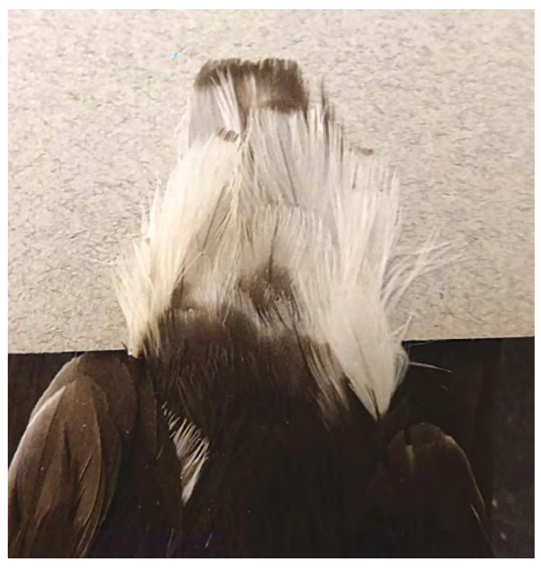
Fig. F5 (above): Alaska, June 30, 1896, CAS 4345. Fig. F6 (below): Alaska, June 17, 1896, CAS 43459.