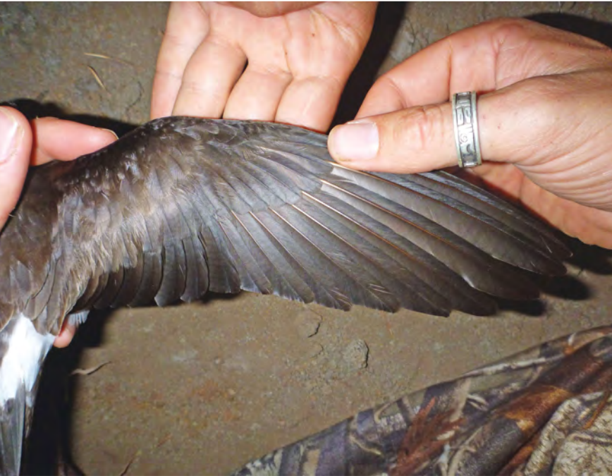
Figs. K1, K2 : Along the Na Pali Coast, Kaua'i, August 23, 2012.