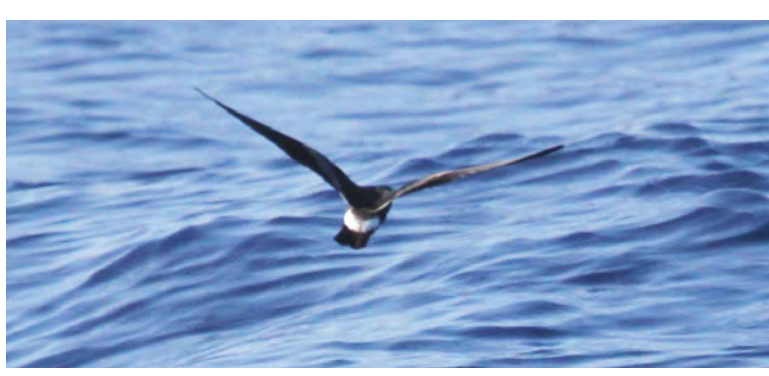
Fig. C. This is the same bird as that shown in Fig. B. Here the upper-tail–covert patch and tail shape appear more typical of a Band-rumped Storm-Petrel . Note too that the apparent central division to the white patch (see Fig. B) is actually a result of a division between slightly displaced feathers on the right side of the upper-tail–covert tract. Other Band-rumped Storm-Petrels photographed by CRC show a similar division down the center of the patch (see Fig. G), making this an unreliable mark on its own for species identification. The whitish appearance to the upper-wing ulnar bar's caudal end (actually the tips to the humerals) indicates a fresh juvenile at this time of year. Off Kona, Hawai'i Island; October 29, 2011.

broad dark tips to the white central upper-tail coverts, which creates the eponymous "band-rumped" appearance, whereas in Leach's Storm-Petrel these feathers are completely white or can have dark corners (Pyle 2008; see Figs. F, G). We have found that this is a good means for separating the two species among sharper images taken by CRC, although this distinction can be tricky to evaluate. We have also noticed that the under-wing greater coverts of Hawaiian Band-rumped Storm-Petrels can be contrastingly paler than the lesser and median coverts, whereas all under-wing coverts are more uniformly colored in Leach's (as discussed in the following pages). Some of the above-mentioned criteria can be used as "average" characters, especially the shape and relative length of the outer rectrix when not in molt, but only with careful study of multiple images, along with consideration of the effects of angle, lighting, and the position and posture of the bird itself.