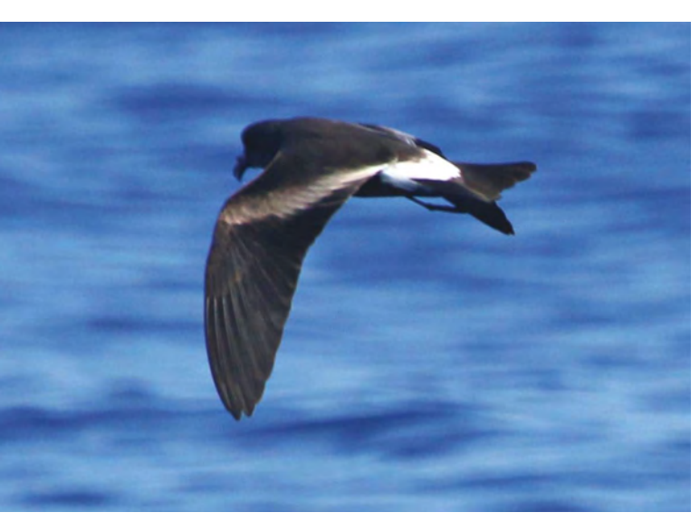
Fig. A. This is the same bird as that shown in the Featured Photo. The shape and division of the upper-tail–covert patch and the forked tail more clearly indicate this to be a Leach's Storm-Petrel . The degree of tail spread, the position and torque of flight, and the angle of the bird relative to the camera can all greatly affect the appearance of the tail fork in these species. Note also the distinct upper-wing ulnar bar in fresh plumage, further supporting the identification. But also note that the white upper-tail area wraps around to the under-tail coverts, a mark ascribed more to Bandrumped Storm-Petrel. Off Kona, Hawai'i Island; November 8, 2015.