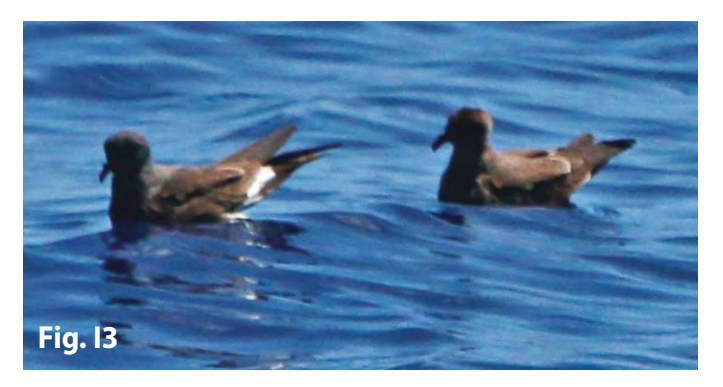
Fig. I1: Kaua'i, October 4, 2006, left, and Hawai'i, September 3, 2001, right (BPBM 185162 and 184416, respectively). Fig. I2: Alaska, June 17, 1896 (CAS 43459). Fig. I3: off Kona, Hawai'i, April 26, 2015.

On a cautionary note, we have photographed adult Leach's with Band-rumped–like bars (Fig. J2) and Band-rumps with more prominent bars (see Figs. M–O). Interestingly, the bars tend to become less prominent with wear, on average more-distinct in fresh juveniles and adults and less-distinct in worn birds, perhaps opposite to what might be expected. As mentioned above, we have noticed in CRC