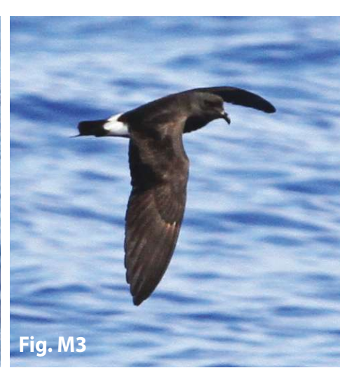
Off Kaua'i, September 4, 2015 ( Figs. M1, M2 ) and September 10, 2015 ( Fig. M3 ).