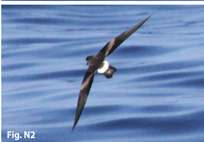
Off Kona, Hawai'i, October 27, 2013 ( Fig. N1 ) and October 29, 2011 ( Fig. N2 ).

bird may be typical of more-worn plumage. Note also the distinctive bracketed shape to the distal ends of both the dark rump and the white upper-tail—covert patch, perhaps reflecting these patterns on the longer central feathers in these tracts. We have noticed this bracketed shape in other Hawaiian Band-rumped Storm-Petrels (see Fig. M3) and have found it useful at times in identification.