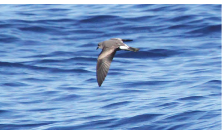
Fig. B. The divided-oval look to the upper-tail–covert patch and longish tail might suggest that this is a Leach's Storm-Petrel, but careful analysis of all 122 photos of this bird (compare with Fig. C) indicate that it is a Band-rumped Storm-Petrel , apparently a recently-fledged juvenile. Enlargement of the images indicates that the longest upper-tail coverts are broadly tipped black. Note also the rather indistinct upper-wing ulnar bar. Off Kona, Hawai'i Island; October 29, 2011.