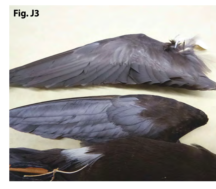
Figs. J1, J3: Hawai'i, September 3, 2001 (Band-rumped Storm-Petrel specimen BPBM 184416) and O'ahu, December 14, 2005 (Leach's Storm-Petrel wing BPBM 184896). Fig. J2: off Kona, Hawai'i, November 12, 2015.

Most or all plumage characters show some to extensive overlap between Band-rumped and nominate Leach's storm-petrels in the central and eastern Pacific. The most reliable character appears to be the patterns to specific upper-tail coverts and to the shape of the tail and outer rectrices. But in each case, and as with all other criteria, assessment of species must coincide with assessment of age, plumage wear, and molt status to reach a confident identification. We have also found that, in the Pacific, more reliable identifications are often possible only with a long series of good images, and we predict that such image series will be needed to confirm a Band-rumped Storm-Petrel in Pacific North American waters.