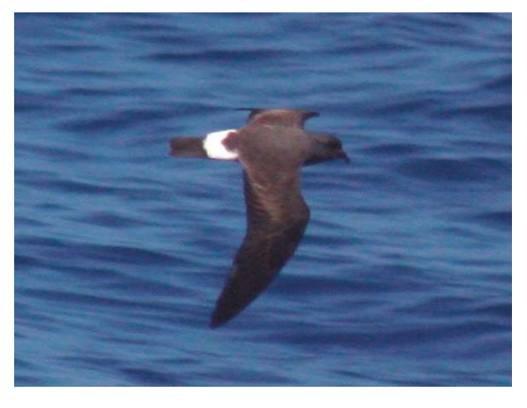
FIG.L This Hawaiian Band-rumped Storm-Petrel is a moderately worn adult. The upper-wing ulnar bar appears to become less distinct with wear, and the indistinct bar on this

FIGS. K Shown here are two of 15 breeding adult Hawaiian Band-rumped Storm-Petrels captured near a suspected breeding colony on Kaua'i. These birds were banded as part of the Kaua'i Endangered Seabird Recovery Project (kauaiseabirdproject.org), which focuses on learning about the breeding distribution and ecology of this little-known species in Hawaii. All 15 birds were at least two years old based on molt clines, and all 15 had brood patches. Note that the plumage is moderately worn on this date, reflecting molt that completes in the spring. The upper-wing ulnar bars of both individuals are indistinct, reflecting moderate plumage wear; and note also the wide dark tips to the upper-tail coverts in Fig. K2.