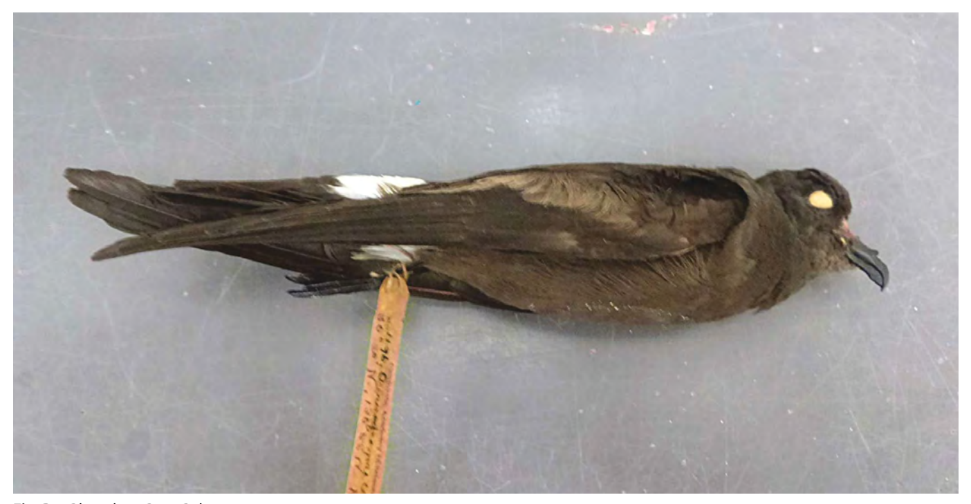
Fig. D1.