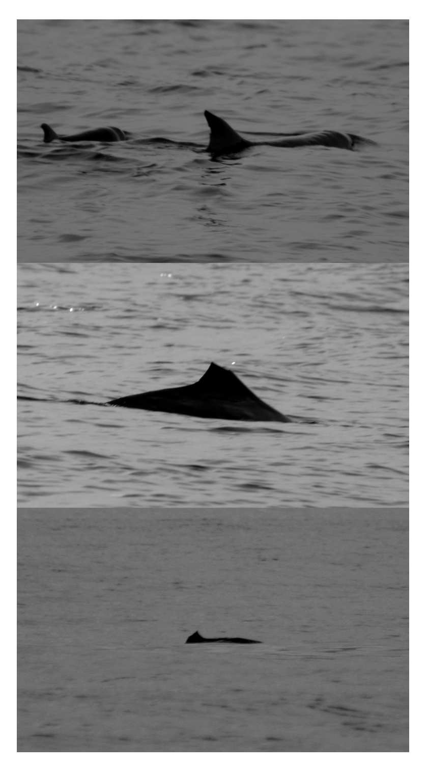
FIGURE 2. Dwarf sperm whales with distinctive dorsal fins ( top, middle ; top right individual with notch in middle of fin), photographed off the island of Hawai'i, 9 October 2003, and possible resighting (bottom) of one individual, photographed 20 October 2003.