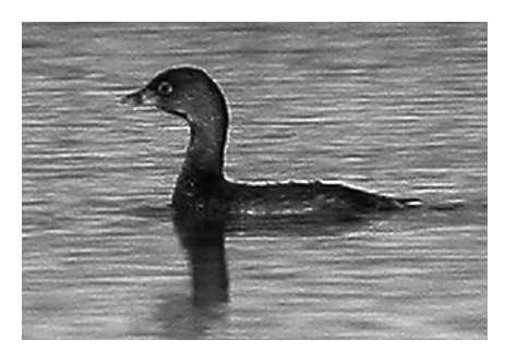
This Pied-billed Grebe at Kahana Pond, Maui Island, Hawaii was often difficult to observe, so this image from 24 January 2010 was a fortunate shot.