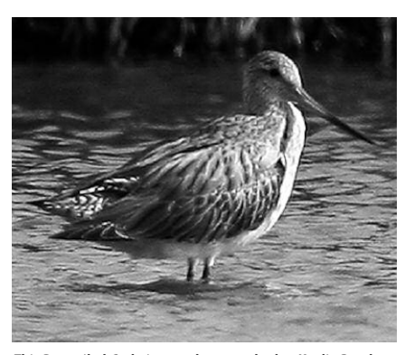
This Bar-tailed Godwit was photographed at Kealia Pond National Wildlife Refuge, Maui Island, Hawaii 26 January 2010.

only reports were of single Glaucous-winged Gulls on Oahu I. at Kaena Pt., 7 Dec (MO, LY), Yokohama Beach, 27 Dec (ph. MW), and Kaawa 27 Dec (ph. GS). A gull at Palaauwai, Molokai I. 14 Dec (ADY) may also have been a Glaucous-winged. The only unusual tern reported over the winter was a Caspian Tern in Kaneohe, Oahu I. 30 Dec (RM, PD). Caspian Terns are uncommon but regular in the Region. One Pomarine and 2 Long-tailed Jaegers