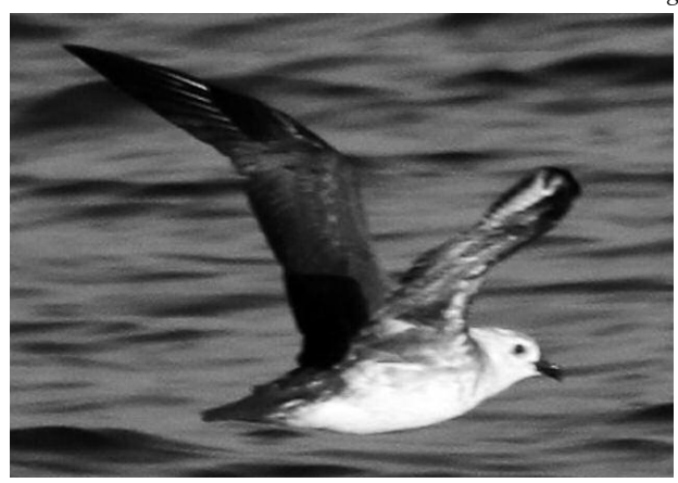
Among the many photographs provided by Cascadia Research Collective working off the Kona Coast of Hawaii Island, Hawaii was this image of a Kermadec Petrel taken 10 December 2009.