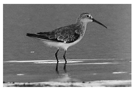
Curlew Sandpipers have become more regular in the Hawaiian Islands over the past twenty years or so, but they remain rare. This bird Pouhala Marsh, Oahu Island 16 January 2010 may have been the same individual as photographed at Kahuku 6 and 12 December 2009.

were photographed off the Kona coast 20 Dec & 8 Dec respectively (C.R.C); the latter species is thought to be relatively rare in the Region, whereas Pomarine is recorded regularly. Up to 58 Red-masked Parakeets, plus 4 Red-masked Parakeet × Blue-crowned Parakeet hybrids, were counted in e. Honolulu 12 Feb (MO). This is the highest count so far for the species.