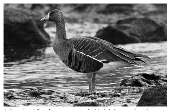
In Hawaii, an influx of uncommon waterfowl included unprecedented numbers of Greater White-fronted Geese, including this one at Punaluu, Hawaii Island 5 December 2009.