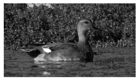
This male Gadwall was observed at the Kii unit of James Campbell National Wildlife Refuge, Hawaii Island, Hawaii over a period of several weeks (here 14 January 2010, the date of discovery) but was sometimes frustratingly difficult to find.