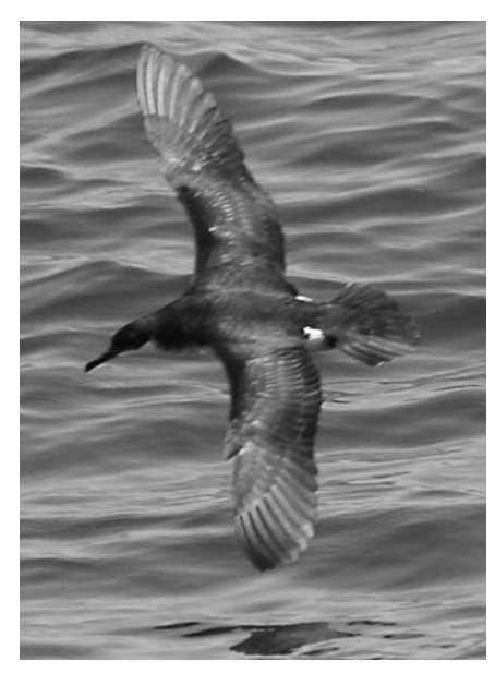
Newell's Shearwaters are uncommon anywhere, but this individual was seen off the Kona coast of Hawaii Island, where they are reported very rarely (here 26 June 2008.)