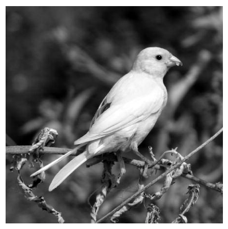
A population of Common Canaries has thrived on Midway Atoll National Wildlife Refuge far from the pet shops where their ancestors were sold and even farther from their native islands in the North Atlantic (here 1 June 2008).