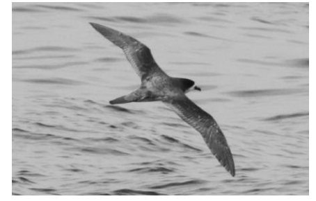
Gadfly petrels are always difficult to photograph, but rarer species, like this Hawaiian Petrel off the Kona coast of Hawaii Island, are a special challenge (here 8 July 2008).