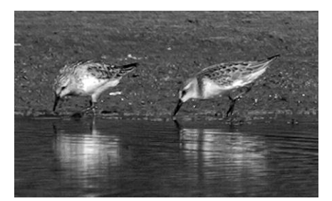
Peeps are uncommon at best in Hawaii, and most species are rare. A photograph of two different rare peeps together—an adult Red-necked Stint and a juvenile Semipalmated Sandpiper at Ohiapilo on Molokai Island 27 July 2008—is thus truly exceptional.