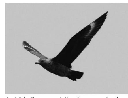
South Polar Skuas are rare in Hawaiian waters and can be difficult to separate from dark Pomarine Jaegers, particularly at a distance. Photographs like this one of a South Polar Skua off the Kona coast of Hawaii Island are invaluable for documentation.

Molokai I. 18 Jun (ADY). A Bristle-thighed at Koheo, Molokai I. 1 Jul (ADY) was probably a newly arrived migrant. Among the newly arriving shorebirds at Ohiapilo Pond, Molokai I. were two unusual peeps: a Semipalmated Sandpiper 24-29 Jul (ph. ADY, ML, MW) and a Red-necked Stint 25 Jul (ph. ADY).