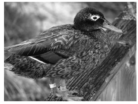
Laysan Ducks are found only in the remote Northwestern Hawaiian Islands, but they have become a bit easier to see and photograph since a number of them were translocated from their native Laysan Island to Midway Atoll National Wildlife Refuge (here 7 June 2008).

Twenty-one Pacific Golden-Plovers counted at Pouhala Marsh, Oahu I. 21 Jun (PD) were in basic plumage and probably summering birds. Shorebird numbers climbed rapidly in late Jul, with counts of 143 Pacific Golden-Plovers at the Honouliuli Unit of Pearl Harbor N.W.R., Oahu I. 27 Jul (PD) and 320 at the same location 30 Jul (PD, RM). Summering Bristle-thighed Curlews were scarce. Two Bristle-thigheds were seen at Palaauwai,