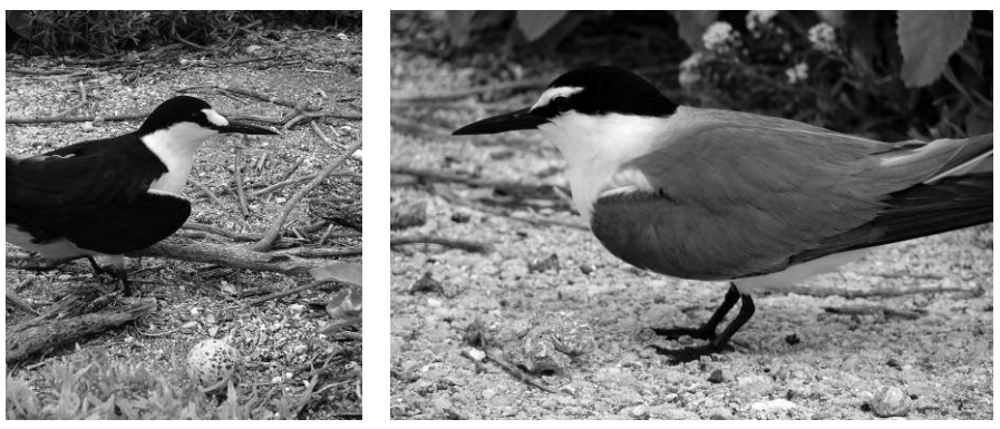
Sooty Terns (left) and Gray-backed Terns nest in large, crowded colonies at Midway Atoll, Hawaii. These photographs are provided for comparison with the possible hybrid tern (below).