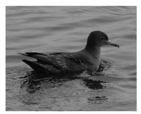
This photograph of a Sooty Shearwater was taken off the Kona coast of the Big Island of Hawaii 24 April 2008.