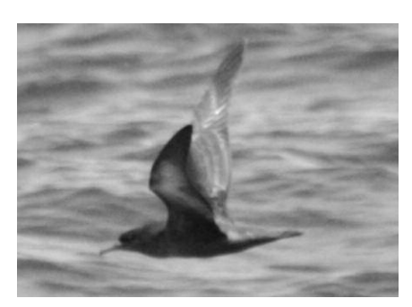
Sooty Shearwaters are frequently reported in Hawaiian waters, but it is often unclear if the birds are Sooty or Shorttailed Shearwaterss. This photograph taken 19 April 2008 off the Kona coast of the Big Island of Hawaii clearly shows the long bill, sloping forehead, and distinct pale underwings characteristic of Sooty.

Region, were at Kealia 6 Mar (MN), and one or 2 others were seen at each of several locations, with the latest report of one at Palaauwai, Molokai I. 23 May (ADY). A Franklin's and 2 Ring-billed Gulls were spotted at Kealia 6 Mar-1 May (MN), and another Ring-billed was at Sand I., Honolulu, Oahu I. 4 Apr (RJ). Single Arctic Terns were observed off w. Hawaii I. 20 & 27Apr (ph. CRC). A Least/Little Tern was found at Moanalua Bay, Oahu I. 3 May (ph. DM) but specific identification could not be determined. Single Gray-backed Terns, rarely observed breeders in the Region, were s. of Oahu I. 17 Mar (GA, PD, DL et al.) and onshore at e. Oahu 7 May (MW). White Terns are locally common around Oahu I. but are seldom reported around the other main islands, so one off w. Hawaii I. 26 Apr, and 2 there 13 May (ph. CRC), were notable. The only Pomarine Jaeger reported was at Wailua Bay, Kauai I. 1 May (MG).