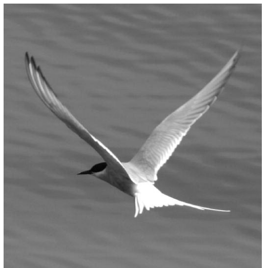
This image shows one of three Arctic Terns observed off the Kona Coast of the Big Island 27 April 2008. Arctics are probably regular spring and fall migrants in Hawaiian waters, but they are rarely observed.