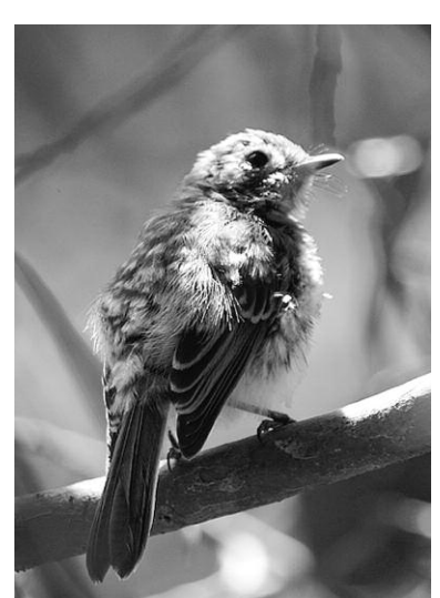
The Oahu Elepaio is an endangered subspecies of Elepaio found only on Oahu Island. This juvenile was one of two observed with their parents along busy Aiea Trail 24 April 2008.

breeding colony in s.-cen. Oahu. There were three reports on Oahu of Oahu Elepaio (Endangered): one at Kuliouou Trail 3 Mar (MW), 4 (2 ads. and 2 juvs.) at Aiea Trail 24 Apr (ph. MW), and one ad. and one subad. there 27 May (PD). Limited access to Waikamoi Preserve, Maui I. was reopened, allowing the observation of 2 Maui Parrotbills 7 & 27 Apr (DK). Tour groups were able to find Palila (Endangered) regularly in the heart of their range at Puu Laau Hawaii I. all season (HFT), but surveys have shown a decrease in the population over the past five years (PB). There were several reports of very small num-