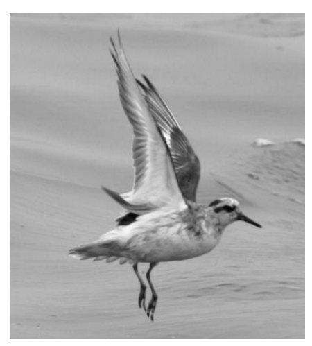
This Red Phalarope photographed 6 May off the Kona coast of the Big Island of Hawaii showed only a few traces of the red plumage that makes the adults so distinctive.

Rose-ringed Parakeets seem to be expanding their range at Kauai I., with 50 at Puakea G.C. 13 May (RD) and others established in the Lihue area (DK). A Mariana Swiftlet (Endangered) at Punaluu, ne. Oahu I. 2 Apr (DK) provided a very rare sighting away from its