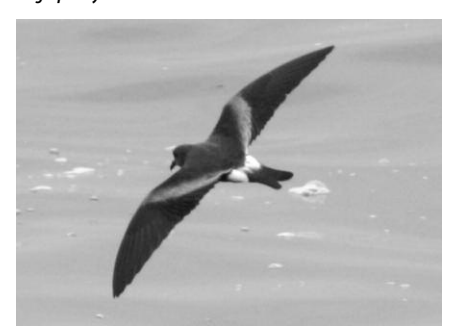
This photograph, taken 6 May 2008 off the Kona coast of the Big Island of Hawaii, nicely shows the forked tail and white rump with dark center of this Leach's Storm-Petrel. Leach's is regular in Hawaiian waters, assumedly as migrants, but the possibility of local breeding cannot be ruled out.

Good numbers of Pacific Golden-Plovers were 230 at Kii 18 Apr (SM) and 53 at Kualapuu Res., Molokai I. 22 Apr (ADY); few birds remained after 1 May. Nineteen Bristle-thighed Curlews at Kahuku, Oahu I. 3 May had dwindled to one by 19 May (PD). Rarer shorebirds included a Red Knot at Ohiapilo, Molokai I. until 15 Apr (ADY), a Curlew Sandpiper at Kahuku, Oahu I. until 21 Apr (MW), and a Whimbrel at Kaunakakai, Molokai I. until 4 May in (ADY). Five Laughing Gulls, an unusually high number for the