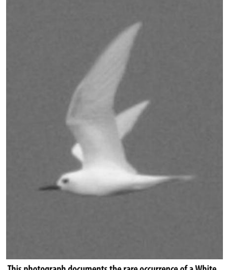
This photograph documents the rare occurrence of a White Tern off the Kona coast of the Big Island 13 May 2008. The only nesting records in the Main Hawaiian Islands are from Oahu Island, about 250 kilometers from Kona.