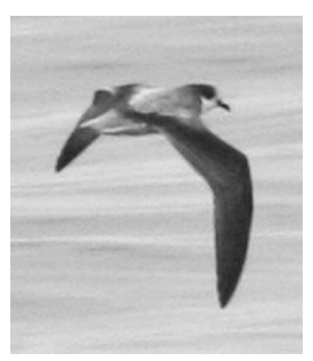
Gadfly petrels are notoriously difficult to photograph at sea, so it was great that both the dorsal and ventral sides of this Stejneger's Petrel were recorded off the Kona coast of the Big Island of Hawaii 14 May 2008. The dorsal view shows the dark "M" pattern and dark crown that contrast with the paler gray on the rest of the upperparts, while the ventral view shows the prominent dark half-collar extending well down onto the underside.