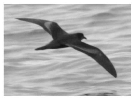
Bulwer's Petrels breed around the Main Hawaiian Islands, but good photographs of the species are rare. The light winds and calm winds prevailing off the Kona coast of the Big Island of Hawaii make it a bit easier to get images like this one, taken 3 May 2008.