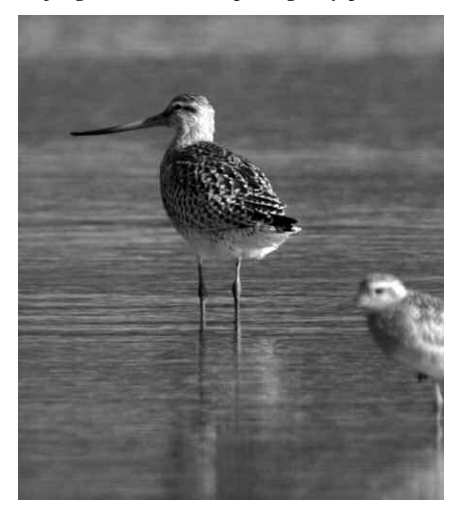
In autumn, most Bar-tailed Godwits are thought to migrate nonstop from Asia to the wintering areas, but a few drop in to the Hawaiian Islands en route. This juvenile was seen at Pouhala Marsh in Waipahu on Oʻahu Island 15 October 2005.

jured bird was found in cen. Maui the next day (conceivably the same individual; *FD); and one was picked up on Kaua'i I. 11 Nov (SR). Up to 30 Cook's Petrels and up to 30 Stejneger's Petrels were observed e. of O'ahu I. 20 Sep (CM, ph. HS). These species can be difficult to separate at sea, but good photographs were obtained of both species. Ten Cook's were seen e. of Kaua'i I. 25 Sep (HS). A petrel turned in to Sea Life Park, O. in early Oct was photographed and released. Based on the photographs, the bird appears to be a Stejneger's, but even captive gadfly petrels are