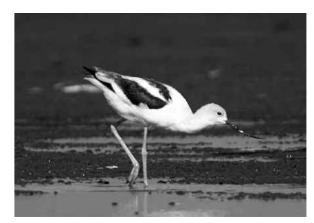
This American Avocet, spotted by Glynnis Nakai at Kealia Pond National Wildlife Refuge on 9 (here 12) September 2005, represents the first record of the species in the Hawaiian Islands.

jured bird was found in cen. Maui the next day (conceivably the same individual; *FD); and one was picked up on Kaua'i I. 11 Nov (SR). Up to 30 Cook's Petrels and up to 30 Stejneger's Petrels were observed e. of O'ahu I. 20 Sep (CM, ph. HS). These species can be difficult to separate at sea, but good photographs were obtained of both species. Ten Cook's were seen e. of Kaua'i I. 25 Sep (HS). A petrel turned in to Sea Life Park, O. in early Oct was photographed and released. Based on the photographs, the bird appears to be a Stejneger's, but even captive gadfly petrels are