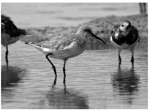
This rare Curlew Sandpiper was spotted at Pouhala Marsh in Waipahu on O'ahu Island on 16 October 2005.

Gulls were fairly scarce this fall. We received reports of one or 2 Laughing Gulls on O'ahu I. and Maui I. (m.ob.) and a single report of a Ring-billed Gull at Kealia 5 Oct