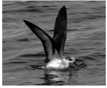
This Black-winged Petrel off Kaua'i, on 19 October 2005 clearly shows the diagnostic underwing pattern that gives the species its name.

Observers submitted only three reports of Hawaiian Petrels (Endangered), one between Kaua'i I and Ni'ihau I. 26 Aug (DK), 3 e. of O'ahu I. 20 Sep (CM, HS), and 2 e. of Kaua'i I. 25 Sep (HS). Various gadfly petrels are believed to be regular migrants through Hawaiian waters, but we normally receive few reports, and some of these are of undetermined species. We had an unusually high number of reports of Black-winged Petrels this season: one was photographed se. of Kaua'i 19 Oct (RB, GS); 2 were well e. of Kaua'i 25 Sep,