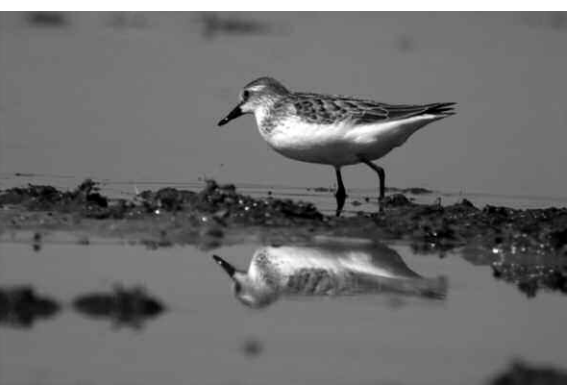
Peeps are uncommon in the Hawaiian Islands, and many that are seen are not identified to species. This bird at 'Ohi'apilo Pond, Moloka'i Island appears to be a rare juvenile Semipalmated Sandpiper, based primarily on bill shape.