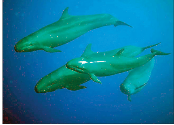
A group of false killer whales from the insular population.