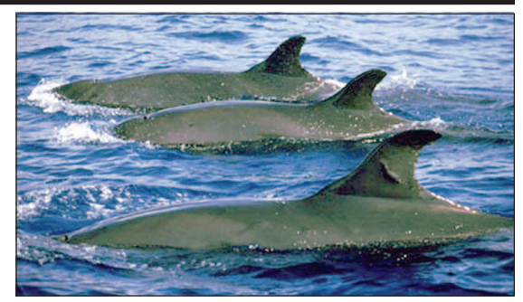
A small population of about 123 false killer whales resides near the Hawaiian Isles.