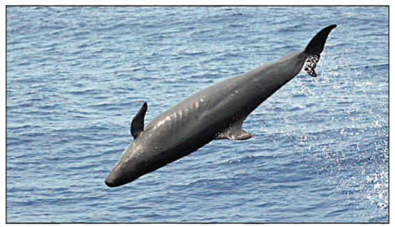
A false killer whale from the offshore population leaping while chasing prey.