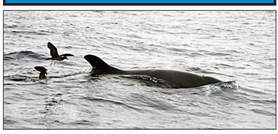
False killer whale carrying prey, followed by wedgetailed shearwaters.