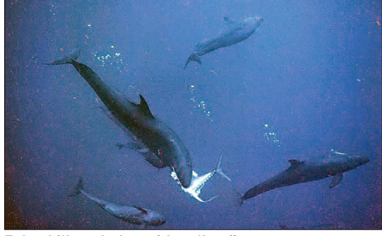
False killer whales with yellowfin tuna.

Like the killer whale (not particularly closely related but with a similar skull), false killers are long-lived (into their 60s), slow to reproduce (having one calf only every six or seven years), and do not start reproducing until their teens. Thus, false killer whale populations would be very slow to recover from any anthropogenic impacts. Also like killer whales, false killers are upper-trophic level predators, thus are likely to accumulate high levels of toxins and be impacted by competition with human fisheries.