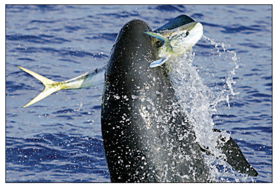
A false killer whale grinds a fresh mahimahi.

PHOTOS TAKEN UNDER NMFS SCIENTIFIC RESEARCH PERMIT NO. 731-1774