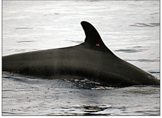
False killer whale with a satellite tag in its dorsal fin.

P.S. If you are interested you can download a report showing some of these movements at <a href="http://www.cascadiaresearch.org/robin/falsekillerwhale.htm">http://www.cascadiaresearch.org/robin/falsekillerwhale.htm</a>.