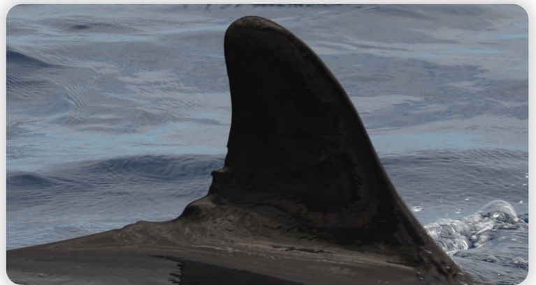
HIPc522 Sighted 2012-2013