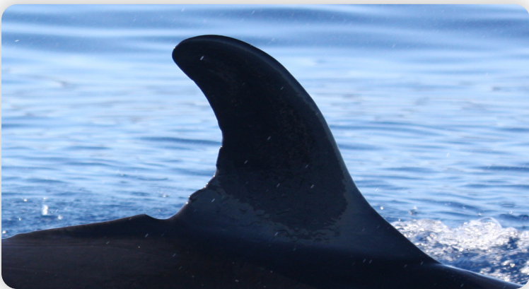
HIPc520 Sighted 2012-2013