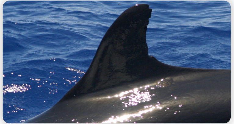
HIPc327 Sighted 2008-2010