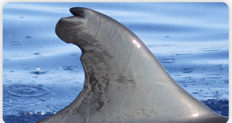
HIPc533 Sighted 2012