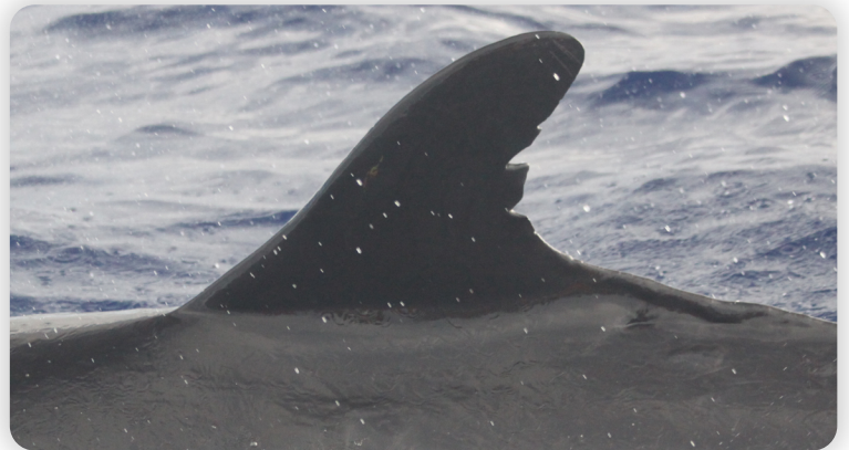
HIPc428 Sighted 2010