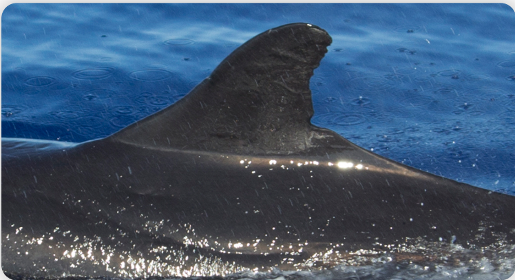
HIPc417 Sighted 2010-2012