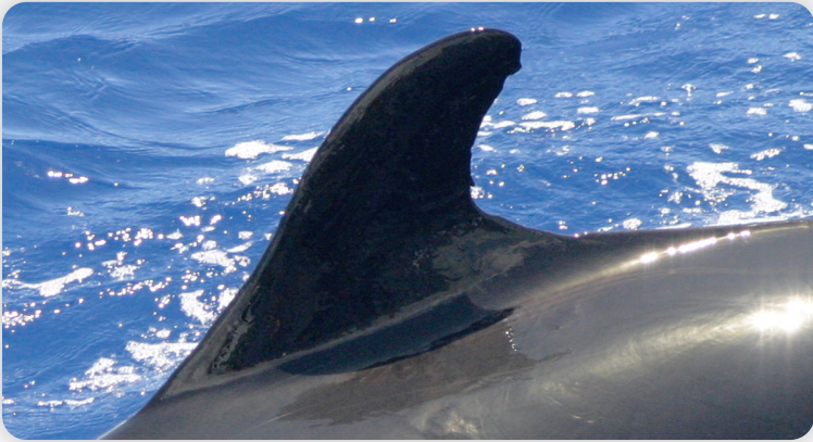
HIPc325 Sighted 2008-2010

Kaua'i, Ni'ihau, & The Northwestern Hawaiian Islands Individuals