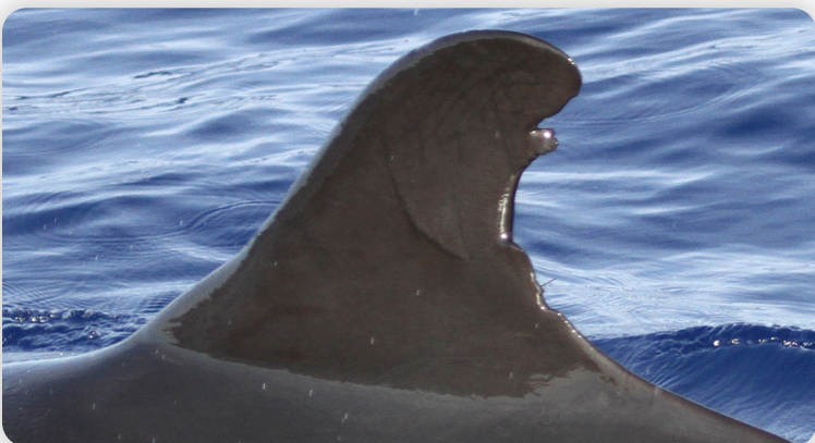
HIPc523 Sighted 2012-2013