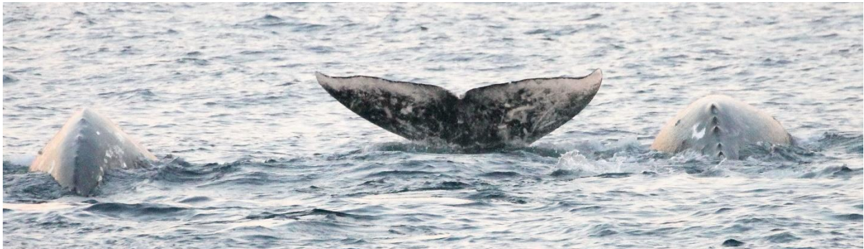
Figure 1. Three PCFG whales migrating together on 12 December 2013 off S California. From left to right IDs are 140, 324, and 107.

We examined photographs of gray whales obtained during the migration to determine if any of these whales were recognized as PCFG whales (Figures 1 and 2). It was too time consuming to go through trying to match every whale to our catalog, so we relied on our two lead matchers familiarity with the regular PCFG whales (that we encounter frequently and so know well) to scan the photographs for whales they recognized. If they suspected they recognized an individual, they would then compare this photograph to our catalog to verify the match and also compare the rest of the whales that were traveling in the same group to our catalog.