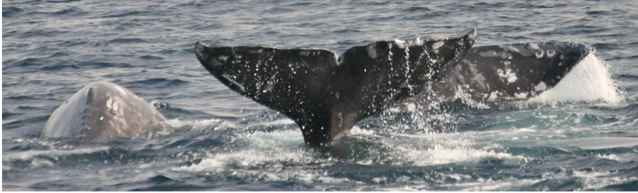
Figure 2. Photo of 3 PCFG whales migrating south together off S California on 6 December 2015. From left to right IDs are 714, 192, and 169.