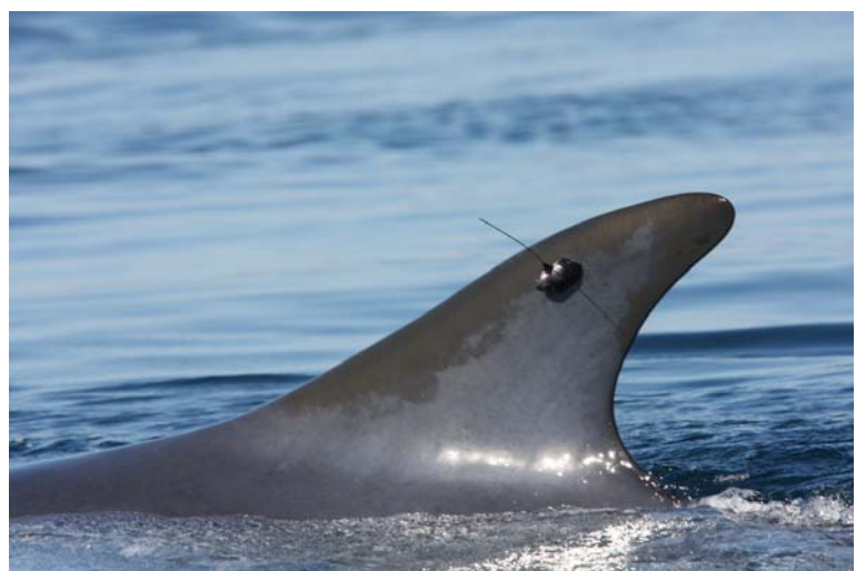
Figure 2. Medium duration satellite tag on a fin whale 23 October 2008.

*For additional information contact Erin Falcone, efalcone@cascadiaresearch.org