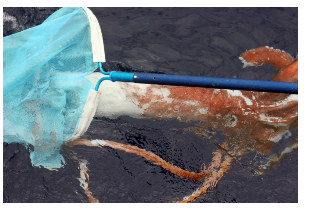
Close-up of the above giant squid in the process of being netted aboard. Large patches of skin have been removed and the arms have been severely truncated by scavenging birds.