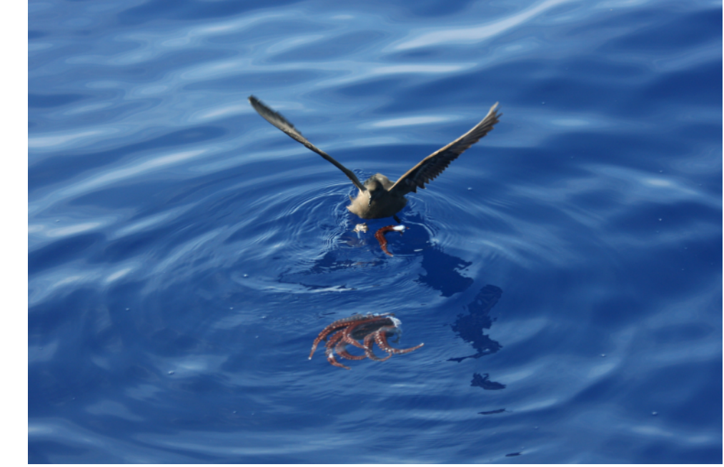
Wedge-tailed Shearwater feeding on the cephalic portion of a jewell squid, Stigmatoteuthis hoylei . The main body or mantle portion has already been removed by scavenging birds.