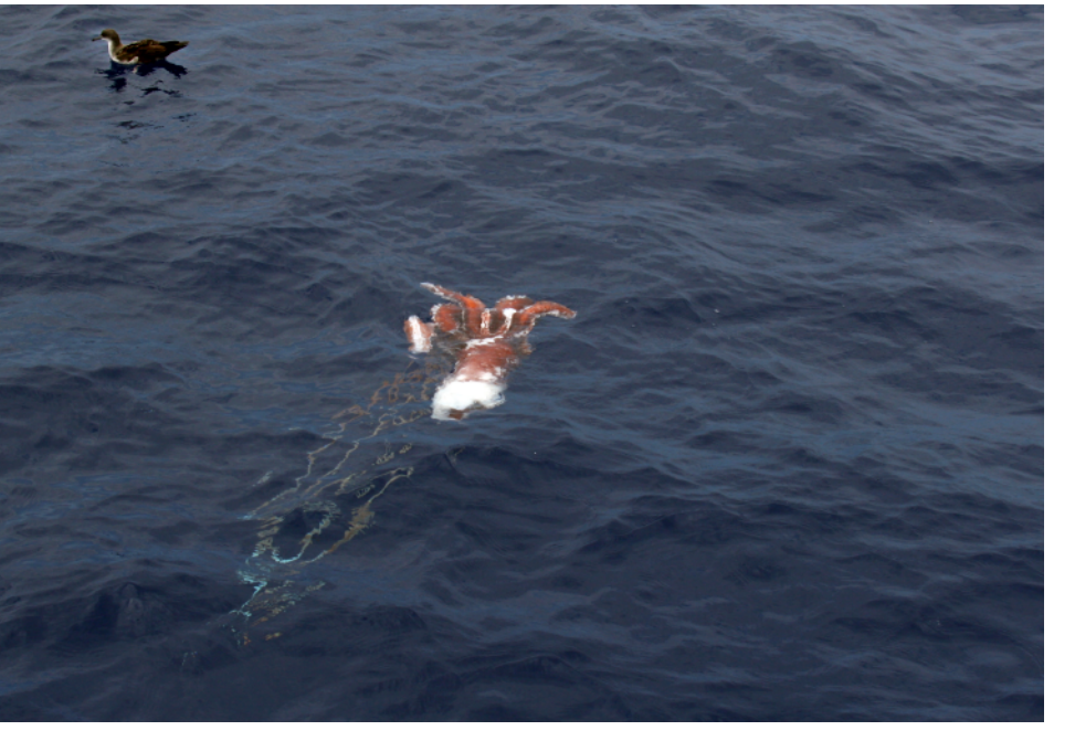
Heavily scavenged giant squid, Architeuthis sp. floating on the surface. The long, thin objects extending beneath the surface are the tentacles. A Wedge-tailed Shearwater is in the background.