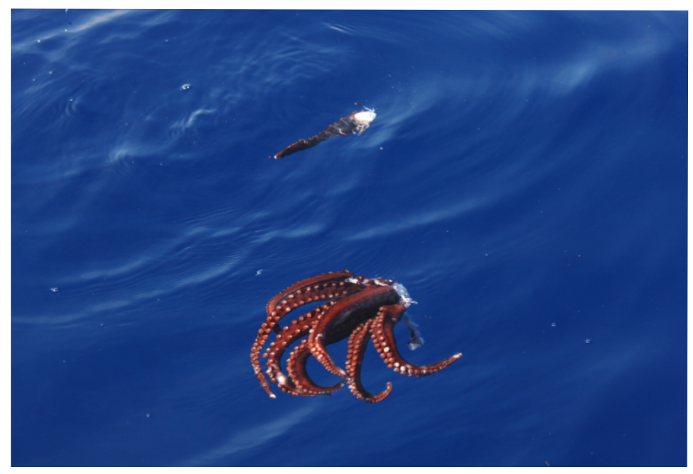
Close-up of above squid shortly after the shearwater has departed. One of the arms has been torn free of the squid carcass.