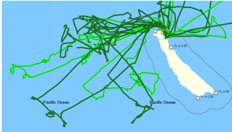
Figure 1a. Survey effort August 2006