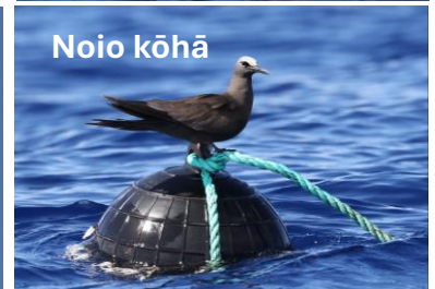
Photographs are not to scale