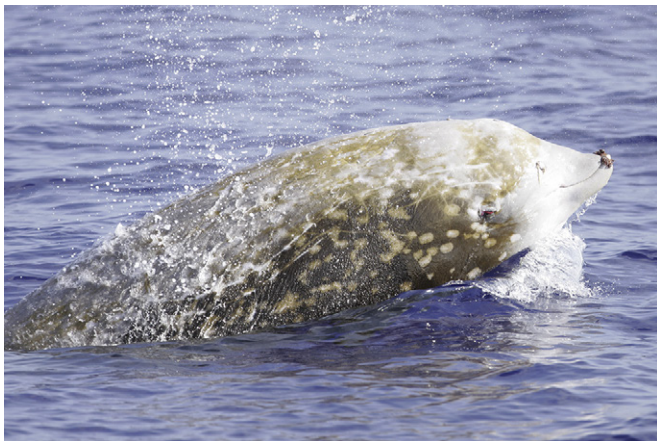
Figure 2 An adult male Cuvier's beaked whale lunging at the surface prior to a long dive. A single tooth is visible at the tip of the lower jaw, partially obscured by attached stalked barnacles. The white oval scars are from cookie-cutter shark ( Isistius spp. ) bites. This individual also has extensive linear scarring from fighting with other adult males.

flippers, and a shallow indentation (“flipper pockets”) where the flippers can recess. Looking at a Cuvier’s beaked whale from behind or in front, the body is quite rounded. There are two teeth, commonly referred to as tusks, located at the tip of the left and right lower jaws, and some specimens examined have also had a number of peg-like vestigial teeth. The tusks erupt only in males, although in the tropics they are sometimes obscured by stalked barnacles ( Conchoderma sp. ). Cuvier’s are generally dark gray in color on the back and side and lighter on the belly, with a dark patch around the eye. They often