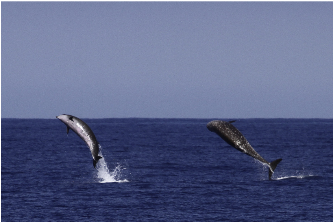
Figure 4 Two Cuvier's beaked whales breaching off the island of Hawai'i. The individual on the right is an adult female, identified off the island in eight different years between 2004 and 2014