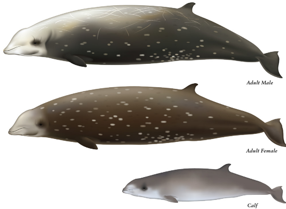
Figure 1 Cuvier's beaked whale, Ziphius cavirostris (Illustrations by Uko Gorter).