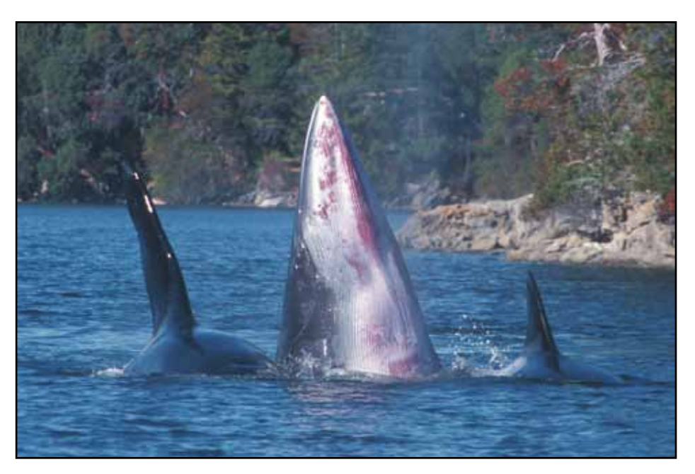
A badly battered minke whale seeks a moment of respite from its tormentors, but the transient killer whales are going to win this contest.

naïve seals in the water increases dramatically, providing easy prey to mammal-eating killer whales.