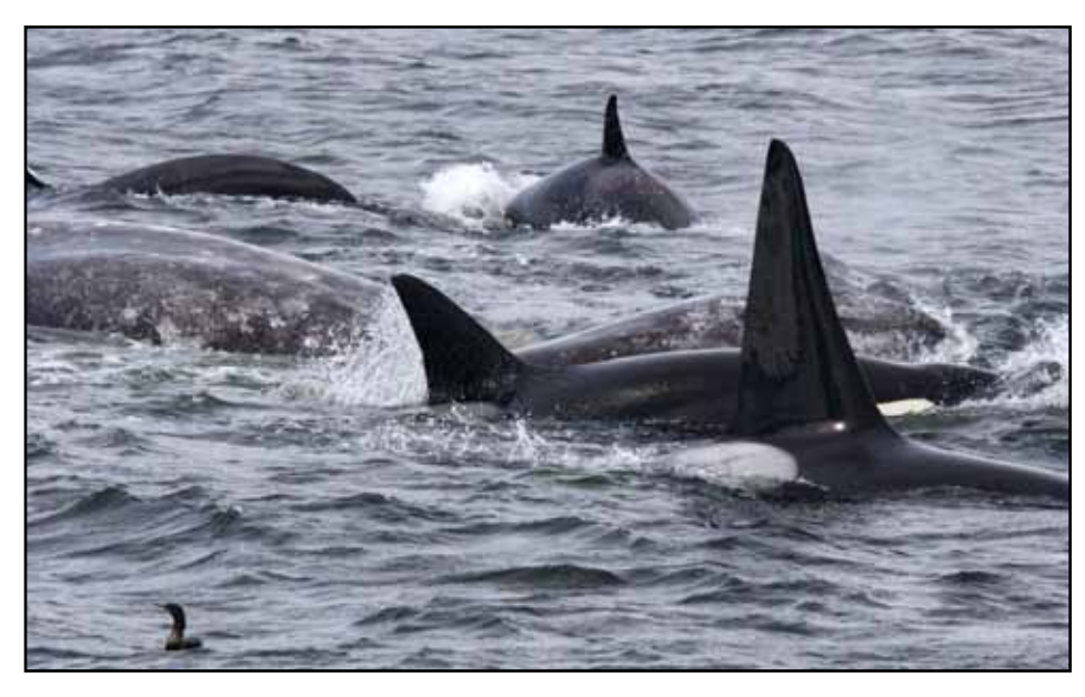
Teamwork: a pod of transient killer whales work cooperatively to separate a gray whale calf from its mother (left) in Monterey Bay, California.