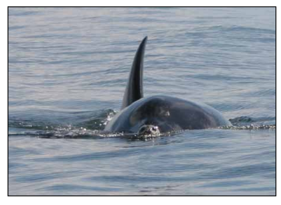
No rush: a live harbor seal in the mouth of a mammal-eating killer whale, being carried awhile before it is killed.

surface waters particularly during the day when visually-oriented predators like killer whales are more likely to be hunting, may be due to avoiding predators like killer whales. The schooling behavior of many species of dolphins may reduce the likelihood that any one individual in the group is taken by a hunting killer whale. It may seem obvious to state that killer whales aren't baleen whales, but they do share some tendencies. Some baleen whales are well-known for their seasonal variations in behavior. typically spending the spring through fall feeding intensively and building up blubber stores for a winter spent in more tropical breeding areas, where feeding is rare. Toothed whales feed year-round, but at least some killer whale populations experience seasonal variability in food intake, albeit to a lesser extent than some baleen whales. In the Salish Sea, harbor seals typically give birth in mid-summer. Pups remain hauled out or close to their mother for the first six weeks of their life. After that they are on their own, naïve, and trying to learn how to survive. In late summer and early fall (August and September) the number of