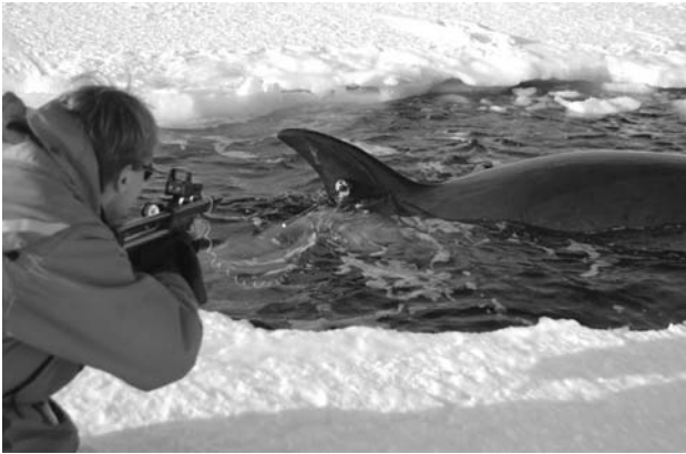
Fig. 2 Attaching a satellite tag to a Type B killer whale in a fast ice lead in McMurdo Sound, southern Ross Sea, Antarctica in February 2006