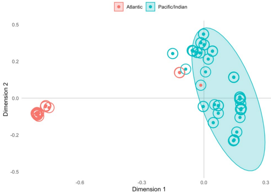
FIGURE S2 Proximity plots for rough-toothed dolphins ( Steno bredanensis ) in the Atlantic (red) and Pacific/Indian (turquoise) oceans from Random Forest models using the mtDNA CR data set.