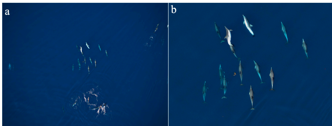
Fig. 1. a) Aerial image of long-beaked common dolphins collected using a vertically-gimballed camera mounted on a remote-controlled octocopter drone. The uncropped frame (a) shows a focal sub-group with other peripheral sub-groups taken from an altitude of 60.6 m (uncropped image footprint = 41.9 \text{ m} \times 31.5 \text{ m} ). The cropped zoom of the sub-group (b) shows the resolution available for photogrammetry measurements. Camera sensor dimensions, lens focal length, laser altitude, GPS coordinates and compass readings were combined to project pixel coordinates to geographic scale to produce sub-group movement tracks over time.

To assess the efficacy of the experimental configuration, we designed a set of custom R scripts (R version 3.6.1, The R Foundation for Statistical Computing) to import, process, and visualize the spatial positioning and temporal tracks of each experimental component. This made use of all experimental components which had an associated GPS sensor, including the RHIB with the MFAS source, the second RHIB deploying the PAM recorders and location of the octocopter over the focal dolphins. For the shore observations, the location of animal sightings in geographic coordinate space was calculated from theodolite readings ( Kniest et al. 2012 ). Using the Leaflet package ( Cheng et al., 2019 ), we created a set of interactive maps that incorporated the track of all the