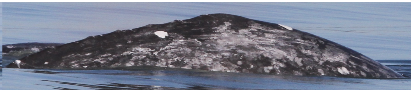
CRCID 723 Male