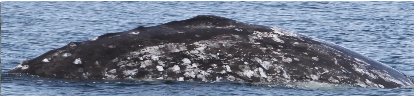
CRCID 531 Female