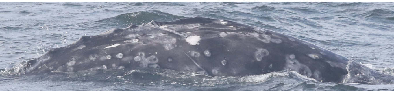
CRCID 2246 Sex Unk