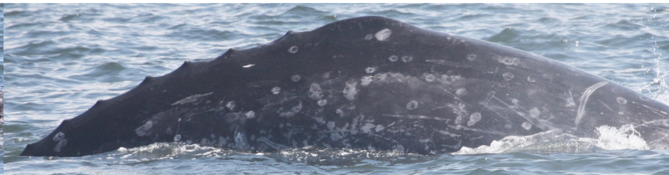
CRCID 53 Male