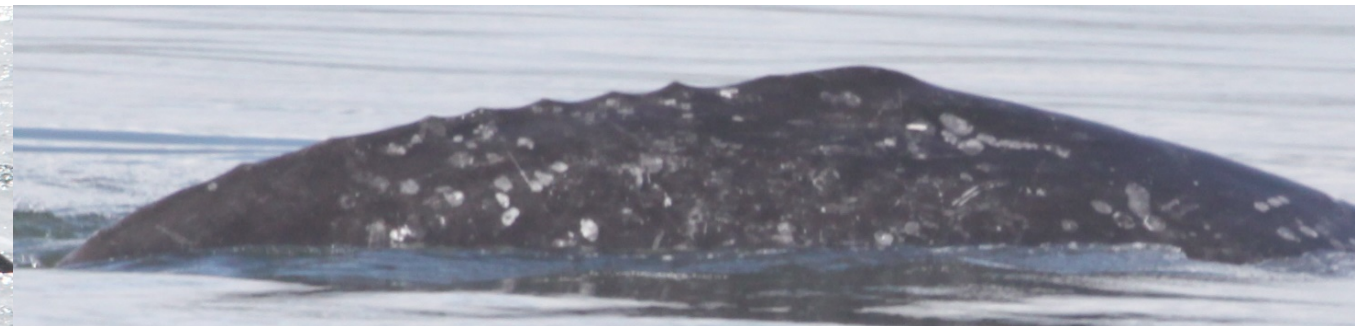
CRCID356 Sex Unk